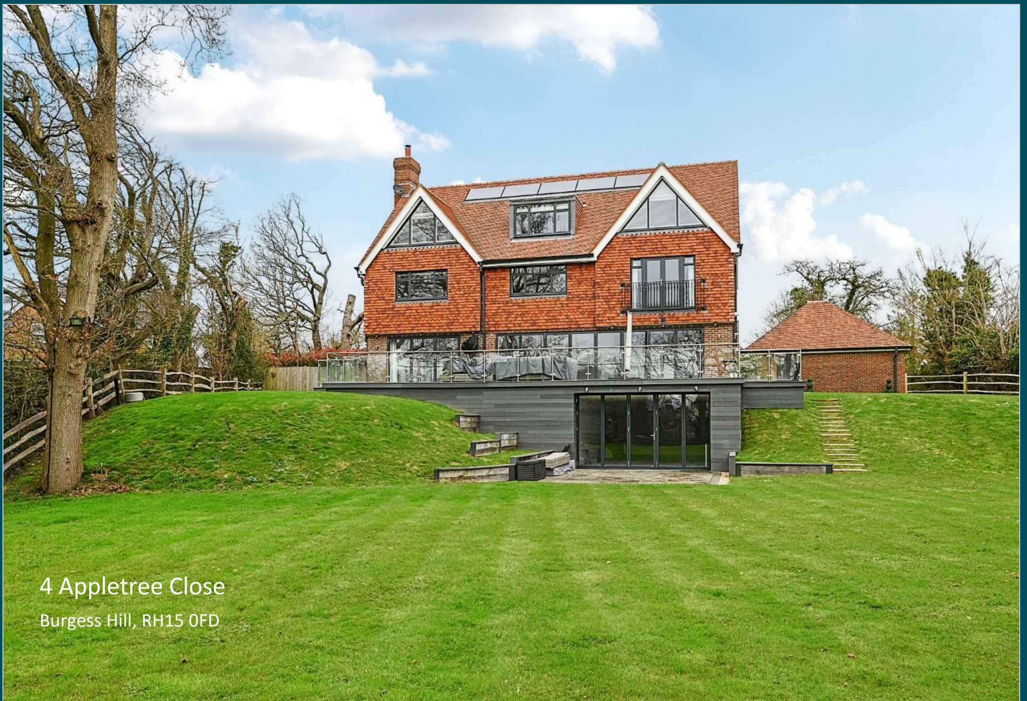
4 Appletree Close Burgess Hill, RH15 0FD